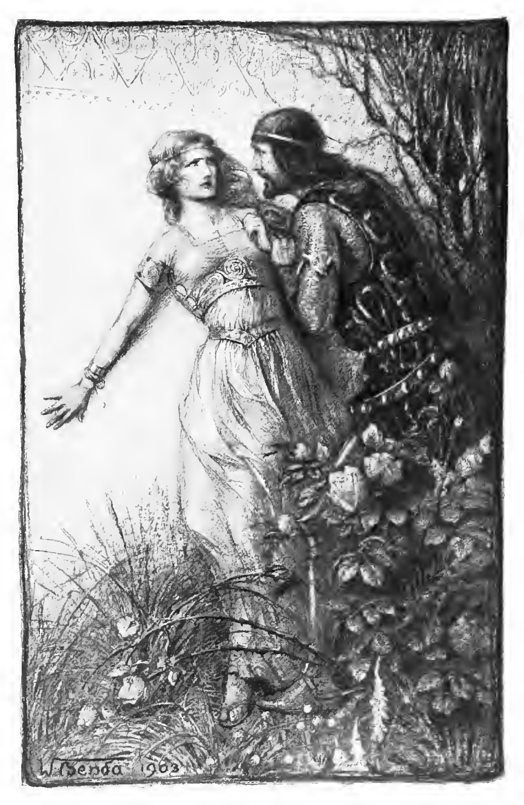
"A SUDDEN MADNESS WHIRLED GORLOIS AWAY"